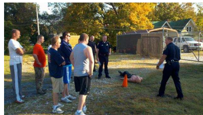
Candidates get an overview of the course